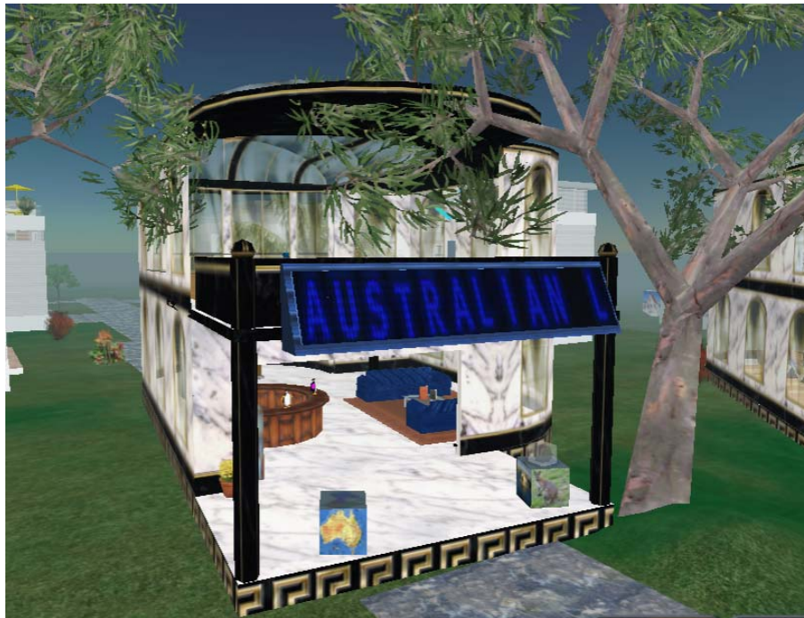
IMAGE 1 – Australian Libraries Building in Second Life, Cybrary City 211, 70, 24

Second Life started in 2003, and there were early library services by January 2005. The Alliance Library System, a consortium of around 260 libraries in Illinois in the United States, started their Second Life Library 2.0 project in April 2006 in a small rented shop front. By September 2007, this project had grown to over forty affiliated islands in the “Information Archipelago”. Library activities centre on Info Island, which receives over 6000 visitors a day. The Australian Libraries Building is a two-storey granite building, surrounded by Eucalyptus trees, on Cybrary City, one of the islands in the Information Archipelago. It is at coordinates 211, 70, 24.